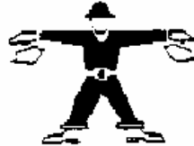
MOVE DOWNWARD Arms extended, palms down, arms sweeping down