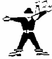
MOVE LEFT Right arm horizontal Left arm sweeps upward to position over head