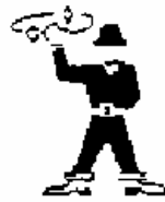
CLEAR TO START ENGINE