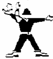
MOVE RIGHT Left arm horizontal Right arm sweeps upward to position over head