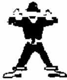
MOVE REARWARD Hands above arms, palms out using a shoving motion