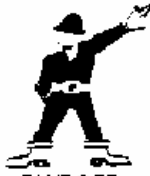
TAKEOFF Right hand behind back Left hand pointing up