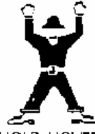
HOLD-HOVER Place arms over head with clenched fists