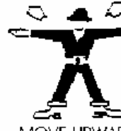
MOVE UPWARD Arms extended sweeping up